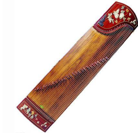
Figure 6 Application Effects of Plant Patterns in Guzheng Design

Plant patterns, which are based on traditional Chinese culture, are characterized by cultural identity and artistic beauty. In the meantime, they have diversified economic values. Wherein, cultural beauty is the value of plant patterns and the fundamental reason why they become important materials for modern design. In addition, plant patterns have a strong and multi-level sense of artistic beauty (as shown in Figure 6), which makes people feel extremely comfortable and happy. All these are attributed to the artistic beauty and charm of plant patterns.