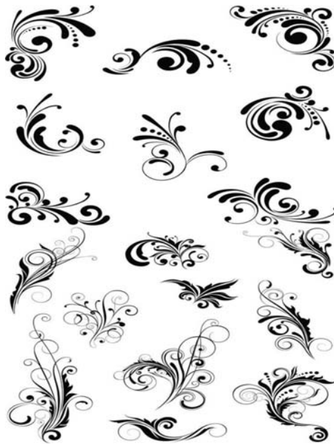
Figure 1 Plant Patterns