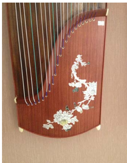
Figure 4 Application Effects of Plant Patterns in Guzheng Design

Colors are not only core elements of visual expression, but important carriers to represent features and connotations of plant patterns. Undoubtedly, different colors have different implications. For example, deep red plant patterns represent auspiciousness, rich and peacefulness; white plant patterns stand for purity and future life; gold plant patterns are designed exclusively for the royal and noble family. Therefore, different colors of plant patterns have different application values, which is referred to as color identification.