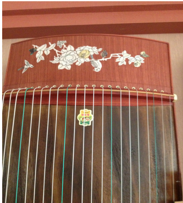
Figure 5 Application Effects of Plant Patterns in Guzheng Design

Plant patterns are important cultural images of Chinese traditional patterns and carriers of traditional culture. In the context of the rapid development of modern technology and civilization, traditional plant patterns serve as centuries-old and positive civilization images. They have been widely applied to contemporary Guzheng design and commercial activities, obtained outstanding artistic achievements and become an important symbol of the development and recovery of Chinese traditional decorative culture.